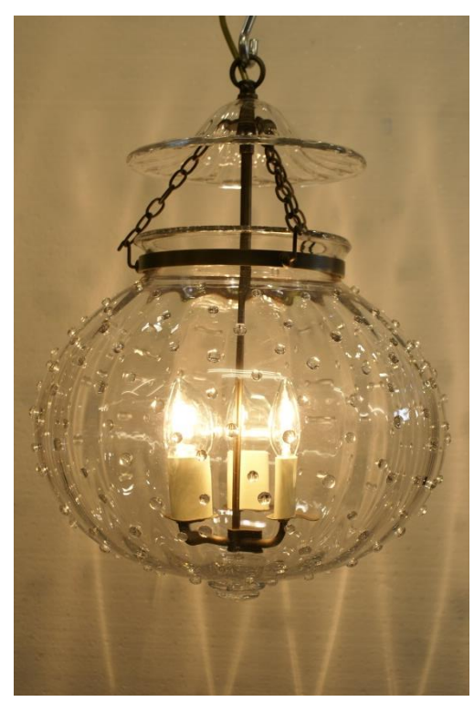
Hand blown pumpkin globe lantern with ribbed detail and small clear dots. With matching ribbed smoke dish and internal 3 way pendant.