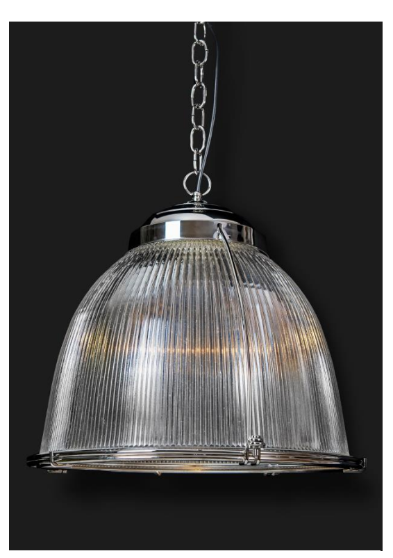
Restored "Holophane" glass pendant light with original stamped glass (Number 6635). Metalwork finished in chrome. H 38cm W 41cm Height given is to top of eye shackle, chain can be supplied in required length.

Art Deco Pillar lights in polished nickel. H 63cm W 8cm Projection 7cm. (Also available in chrome and 37cm or 93cm).