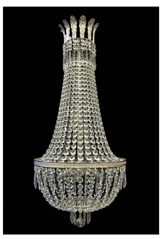
Tent and bag chandelier with octagonal buttons and icicles. Top leaf corona and decorative central banding. Polished nickel. H 125cm W 57cm

Art Deco Pillar lights in polished nickel. H 63cm W 8cm Projection 7cm. (Also available in chrome and 37cm or 93cm).