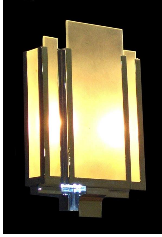
Reproduction Art Deco wall lights as manufactured for Claridge's Hotel, with frosted glass panes. Polished nickel metal work H 34cm W 23cm

A frosted small bowl light with tri form hanging frame. Designed for single pendant. Metal work in a silver plated finish. H 28cm W 14cm